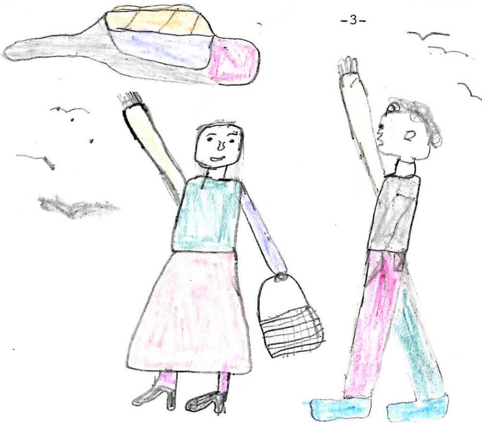
Draw a picture of some visitors who have come to Jamaica from far away.

If you would like to explain your drawing, use this space.